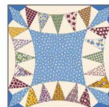
Fig. 1 cut 28